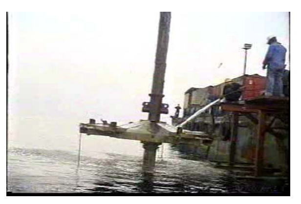
Figure 5: The seabed frame

Shear-Vane and Pocket Penetrometer tests were also done on the samples at site.