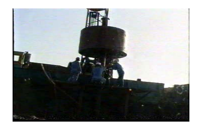
Figure 3: Cylindrical steel tank fixed to the casing pipe to prevent buckling